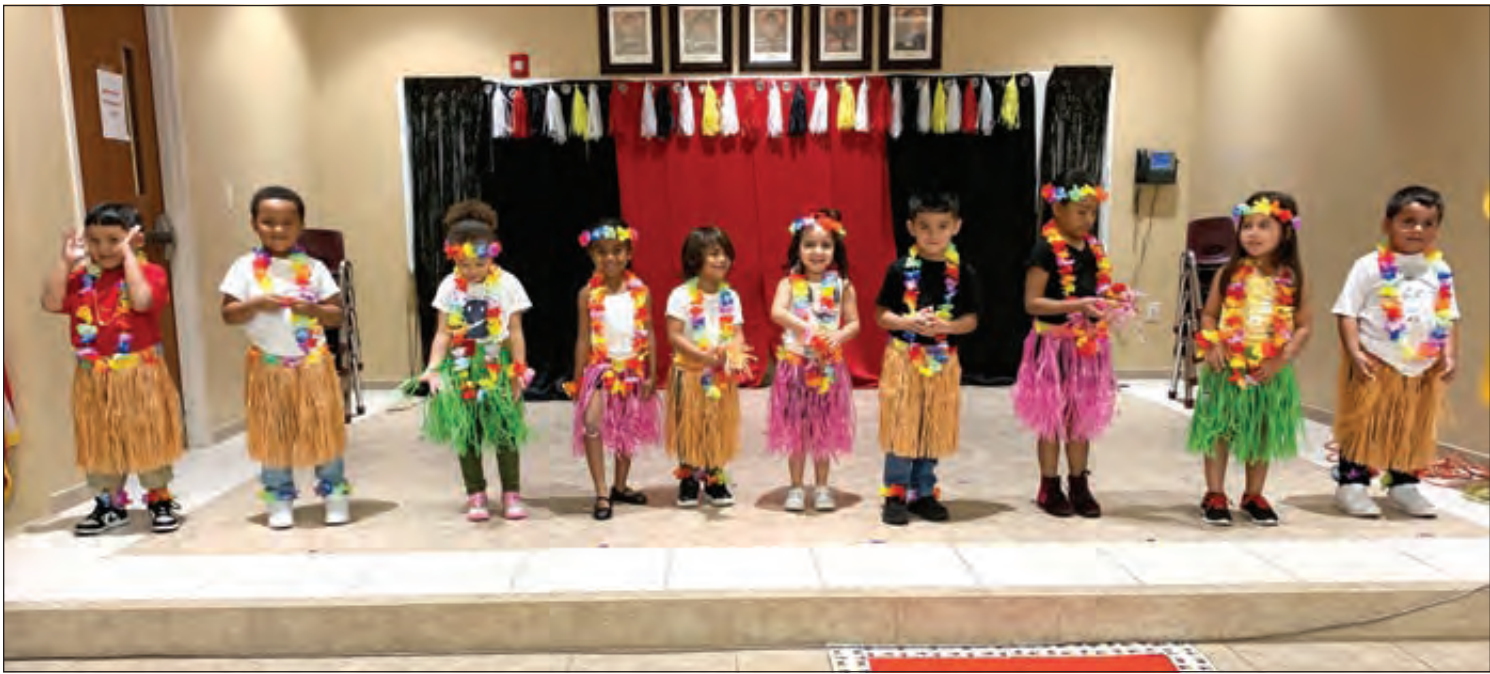
The 10 graduates entertained the audience with a colorful hula dance before receiving their diplomas.