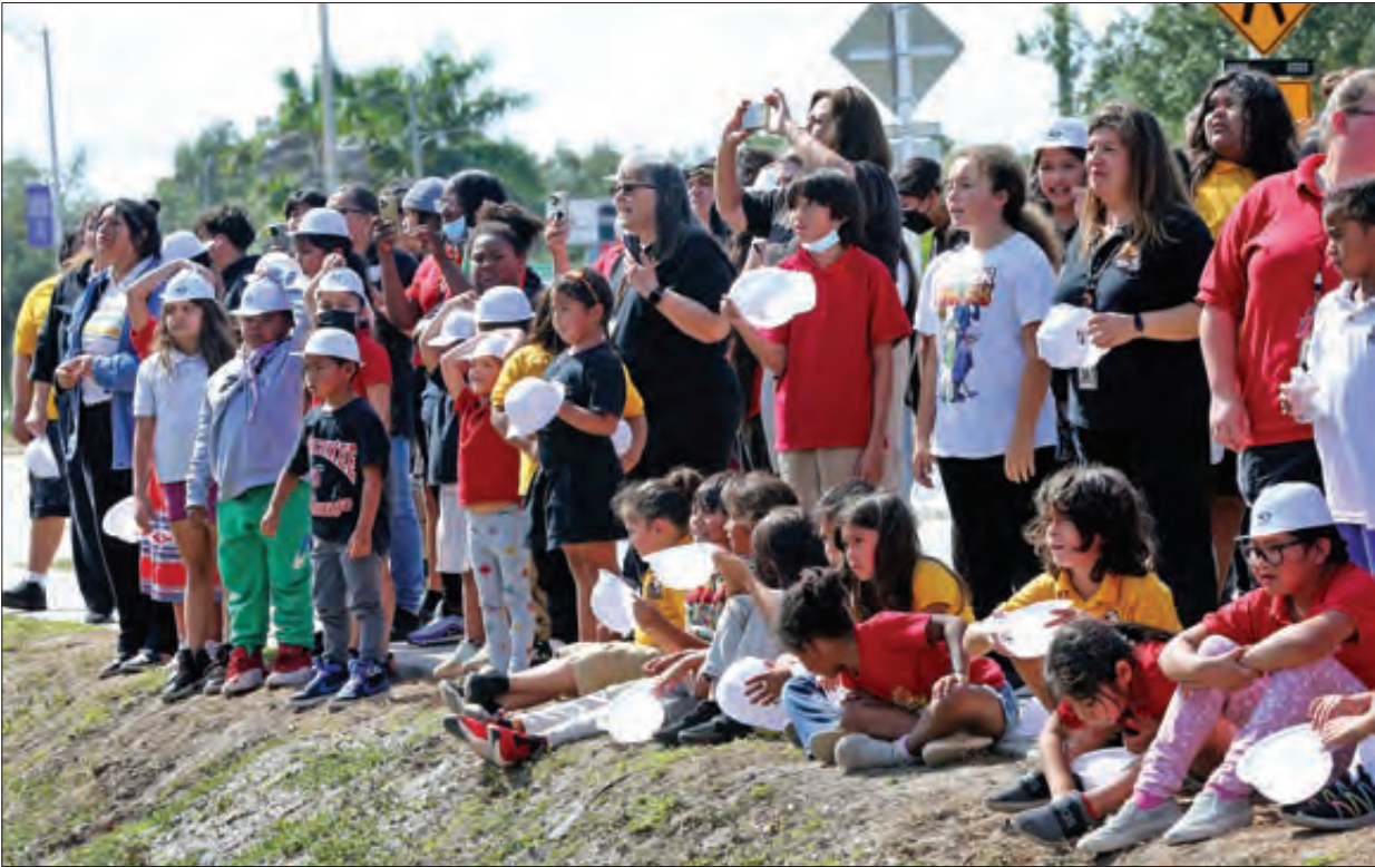
Ahfachkee students gather for the topping off ceremony for the school's new elementary school building on the Big Cypress Reservation.