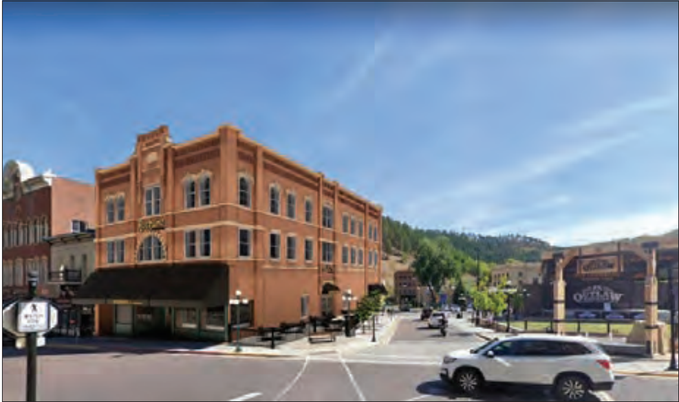
Rocksino is located in Deadwood, South Dakota.