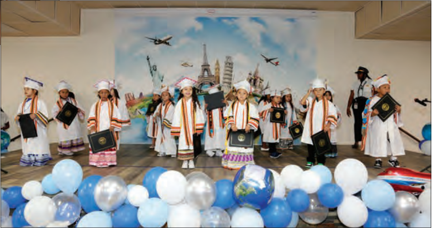
Ready to soar. The Hollywood Preschool graduates celebrate at their ceremony.