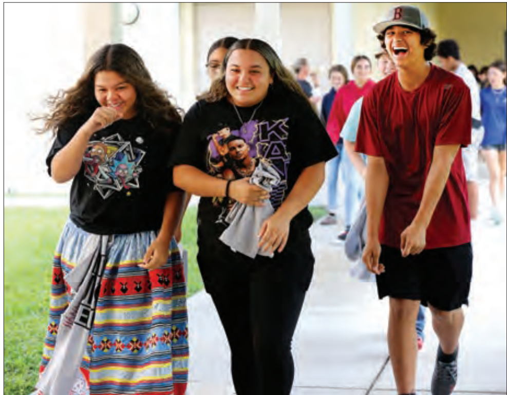
An excited group of students make their final walk as eighth graders through the hallways of the school May 26.