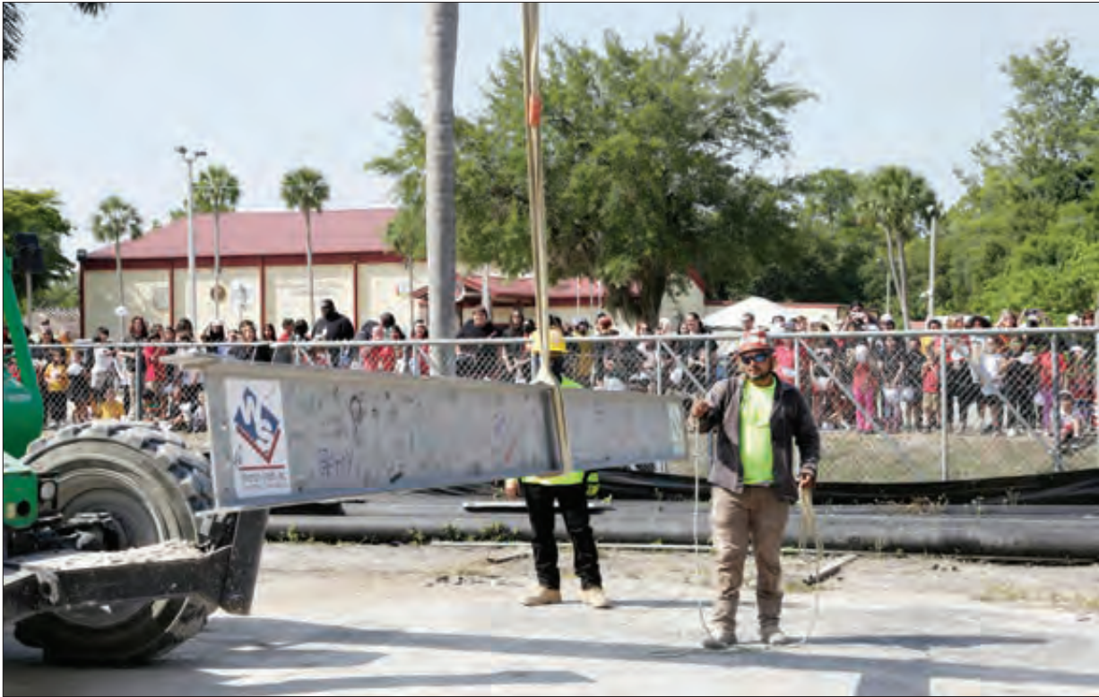
Workers guide the final construction beam as its lifted during a topping off ceremony May 11.