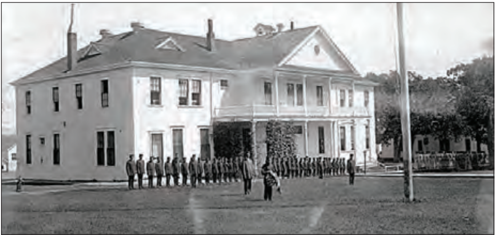
Yakima Valley Museum

More information is at doi.gov and boardingschoolhealing.org .