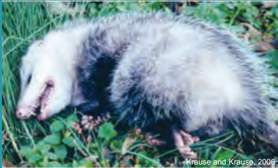
Krause and Krause, 2006

The opossum ( uh-pass-sm ), is a creature whose name most people have trouble pronouncing. Do you include the "o" at the beginning, or do you call this animal "possum"? Different from a rodent, this marsupial, once born, is held inside of a pouch, allowing for more growth and development to happen after birth. Their "milk-teeth" are re-absorbed into their skulls just a few months after birth and all 50 of their adult teeth come through by six months of age. With a similar variety of teeth to humans, the opossum is an omnivore, eating anything from insects to snakes to smaller animals. Even with all these teeth and its sharp bite, the opossum is most known for feigning death (below) when they come across a predator. While 'playing dead' the opossum draws its gums away from its teeth, exposing its full set and readying itself for defense if needed.