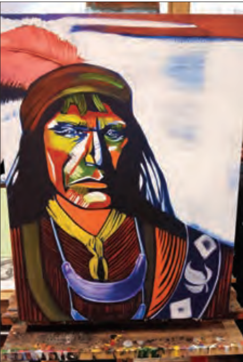
Elgin Jumper's "Colorful Warrior"