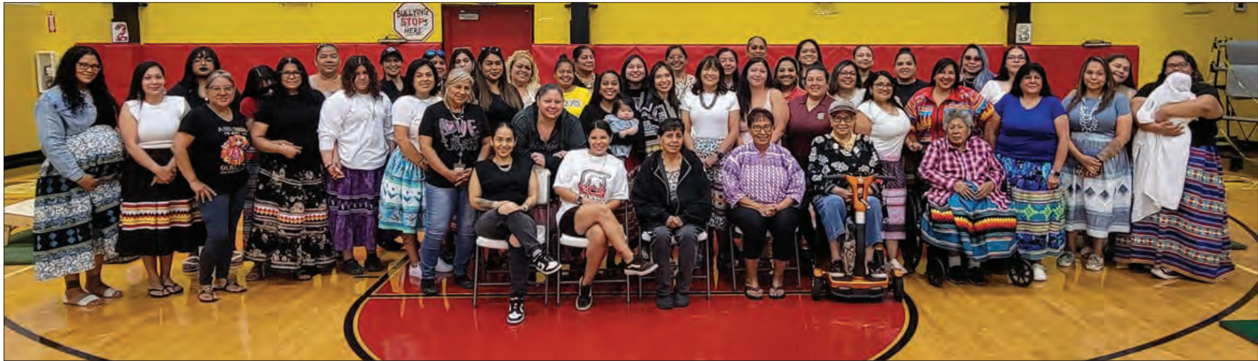
Mothers pose for a Mother's Day photo in the Immokalee Reservation gym May 4.