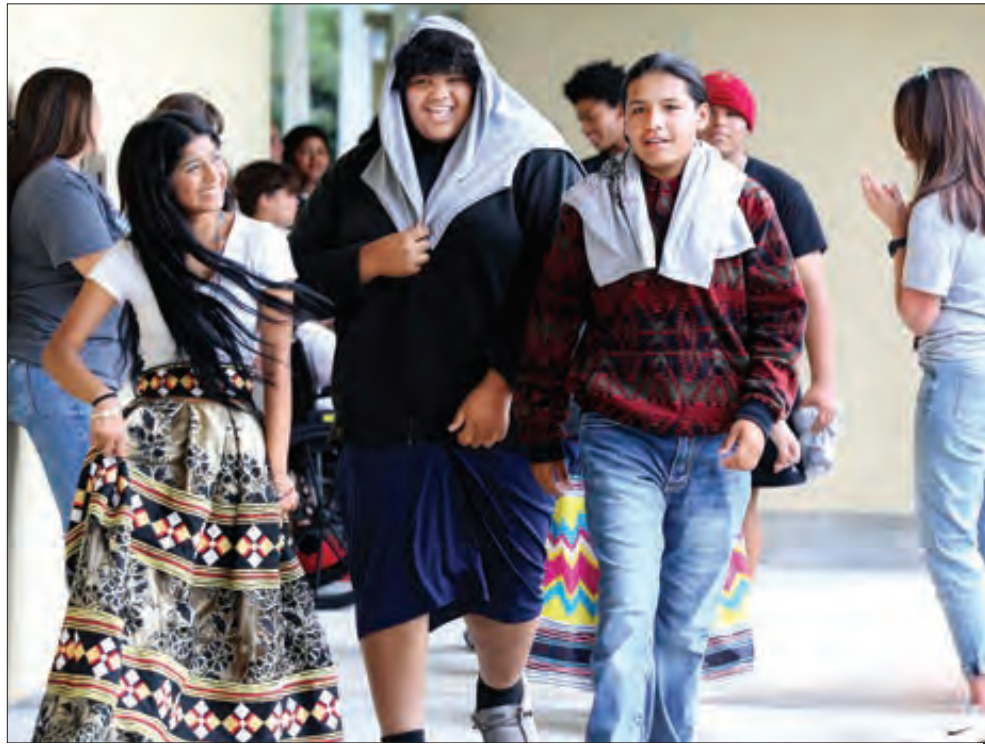
Eighth graders walk through the school's breezeways during the traditional eighth grade final walk where the student body applauds their success.