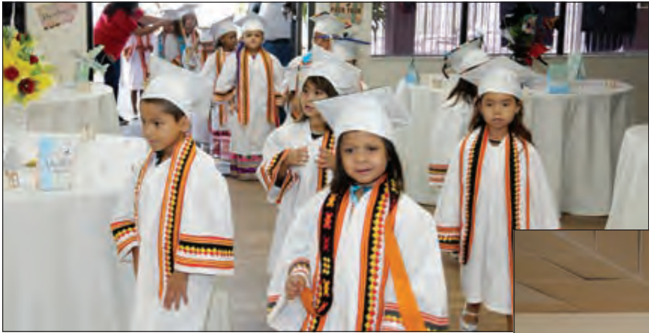
Hollywood Preschool's class of 2023 enters the Seminole Estates clubhouse for the graduation ceremony.