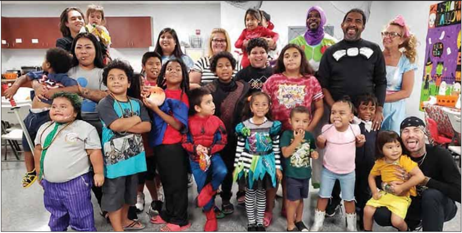
Seminoles and staff celebrate the first Spooktacular Halloween Party at the Tampa Recreation Center on Oct. 25.