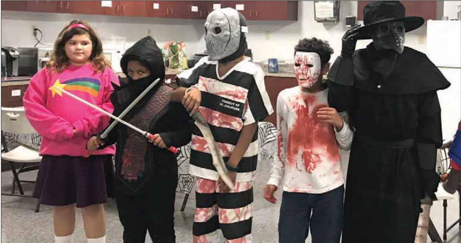
Young Seminole enjoy a Halloween costume contest in Tampa.