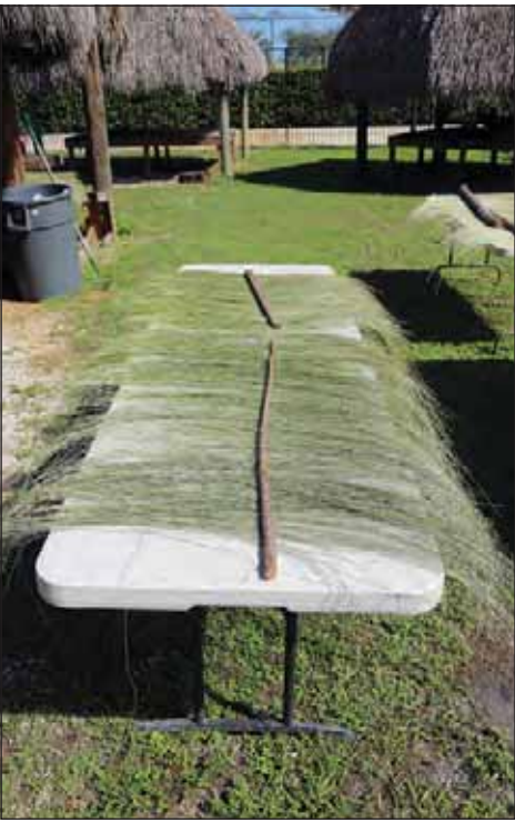
Above, Kiana Bell’s work could be displayed in the future at the Ah-Tah-Thi-Ki Museum in Big Cypress. Below, sweetgrass is set out to dry.