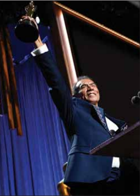
Wes Studi gives his acceptance speech after receiving an Honorary Oscar on Oct. 27 at the Governors Awards in Hollywood, California. Looking on, from right, are U.S. Poet Laureate Joy Harjo, and actors Christian Bale and Q'orianka Kilcher.